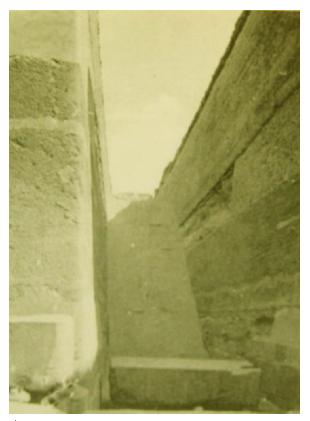
Plate VI, 1

The pit had been filled by rubble and sand; it was necessary to take out more than 4,000 cubic meters of excavated material to expose a pavement of enormous blocks of pink granite. Mr. Barsanti hoped, by removing one of these blocks, to find a funerary vault underneath: because several fragments found in the rubble had the name of the King Nofirka, of the II dynasty, written on it. The raised stone showed another block and, underneath there were three other superimposed on each other, the last one rested on rock.